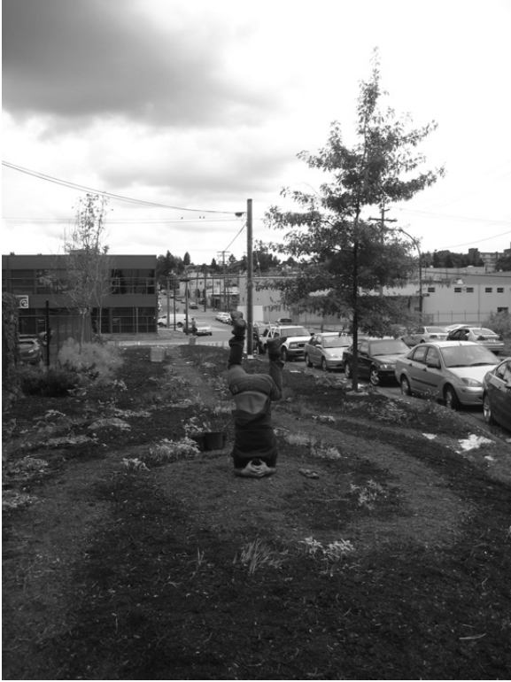
Sweet dreams, all.